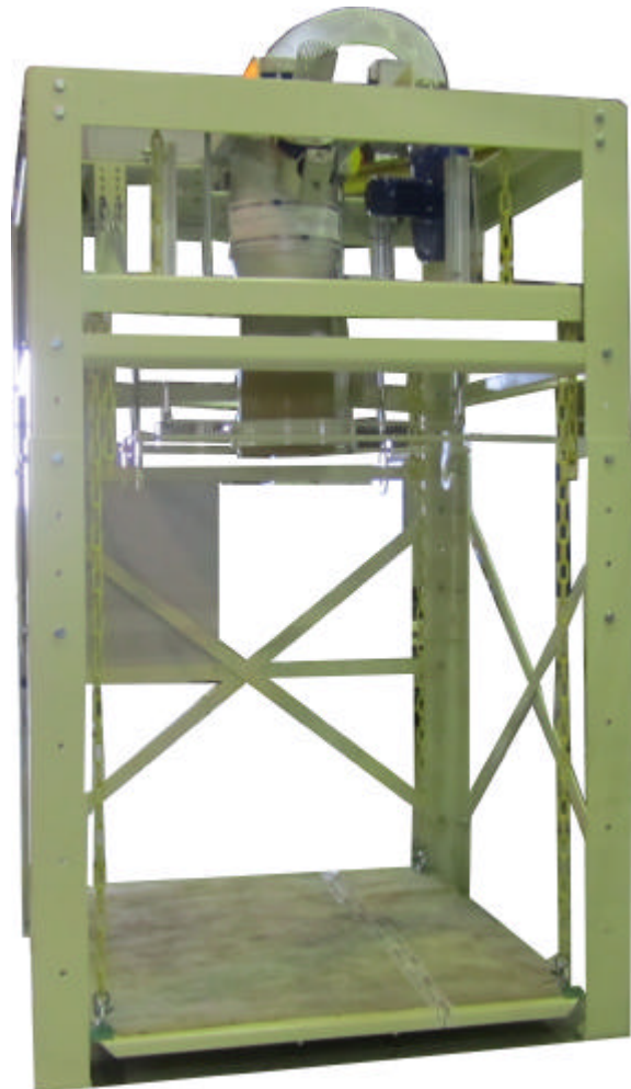
Compact and economical filling unit for different big-bags