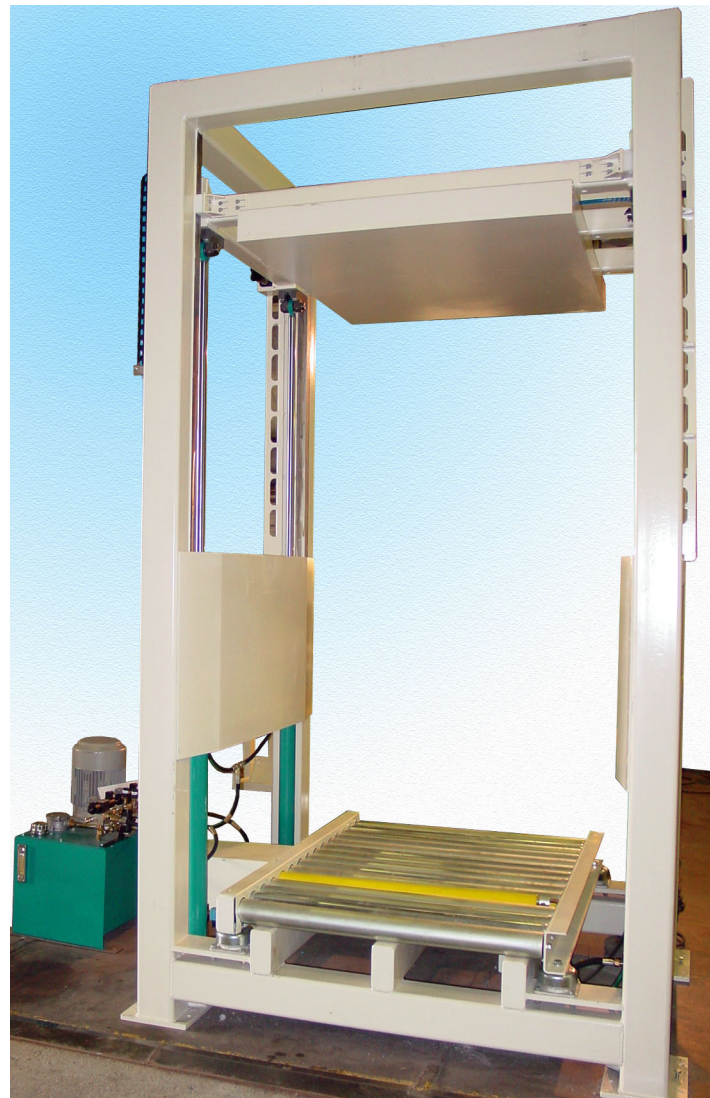
Full pallet press for compressing bag pallets after palletizer